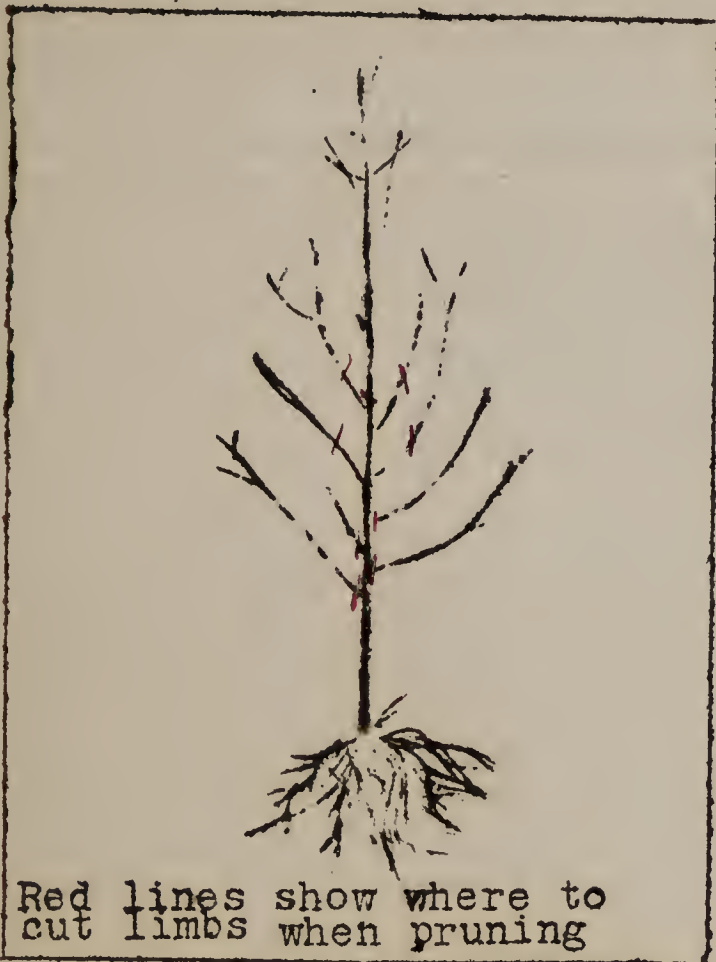
Red lines show where to cut limbs when pruning

Peach trees are generally headed from 30 to 36 inches from the ground, all branches cut back to within one inch of the trunk, leaving one or two strong buds. The open head or vase type is favored. It is formed by developing three to five branches, spirally placed and several inches apart.